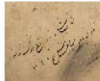
A Persian manuscript without illustrations : Shahnama (Book Of Kings) of Firdousi, from The library of the Governors of Khanat-I Tâlesh, Iran, Shiraz, Circa 1560. Acquired in France before 1925. - 45 x 27,4 cm. 11 kg. 10.000/15.000 euros