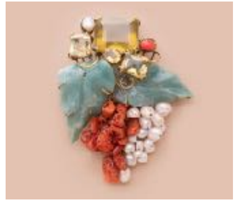
A small gold box with initials of H.H.I Princess Hanzade Sultan, Europe, 20th century. 7,3 x 5 x 1 cm, 800/1.200 euros - A signed gold brooch in the shape of a grape, by Iradj Moini, 1990/2000 11 x 9 cm. 134 g. 1200/1500 euros

This first thematic sale of floral and calligraphic art will bring together rare, eclectic and accessible works, such as a set of medieval ceramics from a private collection published in a catalog and exhibited in Germany in 1989. Also included in the sale is an Ottoman chest with acanthus leaf rinceaux from the late 18th century as well as an important set of calligraphies and album pages with gilded floral and animalistic margins by the greatest Persian masters. The program also includes contemporary works, such as a brooch of naturalist inspiration by the Iranian jeweler Iradj Moini recently spotlighted at an exhibition at the Metropolitan Museum in New York.