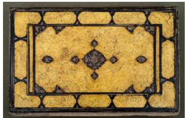
A Persian manuscript without illustrations : Shahname (Book Of Kings) of Firdousi, from The library of the Governors of Khanat-I Tâlesh, Iran, Shiraz, Circa 1560. Acquired in France before 1925. - 45 x 27,4 cm. 11 kg. 10.000/15.000 euros

This remarkable Persian manuscript from the prestigious workshops of Shiraz, in fifteenth-century Iran, is a Book of Kings (Shahnameh) whose provenance since the 17th century has been traced by the auction house Rim Enchères as well as by a number of art scholars. This majestic work was part of the collection of the princes of Tâlesh (Iranian governorate covering the north-western region of Iran and the south of the current Republic of Azerbaijan), who passed it on to their successive heirs, across generations. Several owners' seals and bookplates display eminent personalities of this lineage, revealing the manuscript's course from the mid-17th century to the end of the 19th century. Arriving in France prior to 1925, it was acquired by a private collector, and kept since then within the same family for nearly a hundred years.